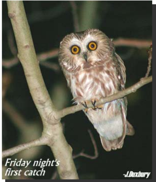
Friday night's first catch

Unfortunately for those who planned to come out the following night for the second round of Steaks and Saw-whets, the weather did not cooperate. Rain and wind made for a miserable night and no owls were banded.