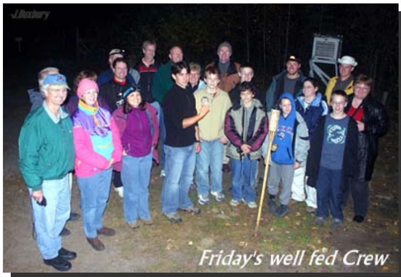
Friday's well fed Crew

we can do is wait for next year's event and hope for the same weather we had on the Friday night. See you next fall!