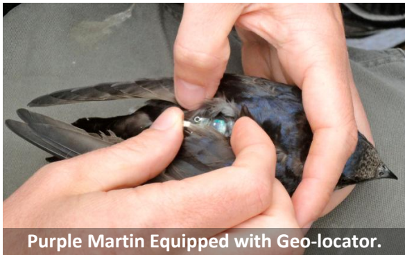
Purple Martin Equipped with Geo-locator.