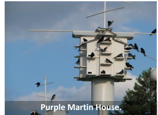
Purple Martin House.

The Purple Martin, Progne subis , is the largest swallow in North America and is among the largest in the world. In eastern North America this species now breeds almost entirely in backyard birdhouses. Historically, they nested in abandoned woodpecker holes in tree snags. Only a few records of natural nestings east of the Rocky Mountains have been reported during the twentieth century (C.R. Brown, Birds of North America, 1997). Breeding bird survey data suggest that populations in northern North America are declining. Some potential causes of declines may be competition for nesting sites (in the man-made nest apartments) with European Starlings and House Sparrows (not-native species) and problems on their wintering grounds. Purple Martins migrate from South America to North America in the spring to breed; they can arrive in Alberta as early as mid-April. They do not remain long however, by the beginning of August they are already migrating south back to their wintering grounds. Their most northern breeding sites are in central Alberta. Camrose is well known for the impressive number of Purple Martins that reside there during the summer. Camrose is also home to a number of very passionate birders, Purple Martin house landowners, and Dr. Glen Hvenegaard of the University of Alberta's Augustana campus.