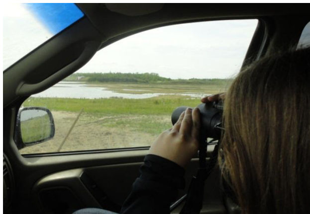
Checking out the waterfowl

Unfortunately, the trip out to the gravel pits south of Tofield was slightly disappointing species-wise, as the American Avocet was the only new species present! The trip through the town itself was equally frustrating, as the resident (and always present) Merlin was nowhere to be seen or heard. It truly seems as though the birds conspire against us during the Birdathon, as several species that are seen on a daily basis, such as the Vesper Sparrows in the fields, disappear when you are looking for them!