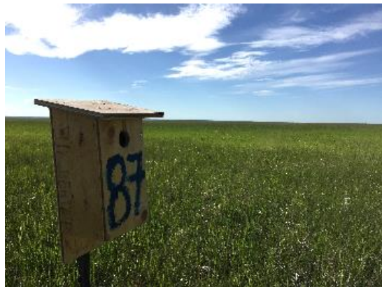
Figure 2: An example of the new Tree Swallow nest box.

All nest boxes are on metal poles. The original nest boxes open from the top and the new nest boxes are side opening. The height the nest boxes, the direction each nest box faced, and the distances between all of the nest boxes varied.