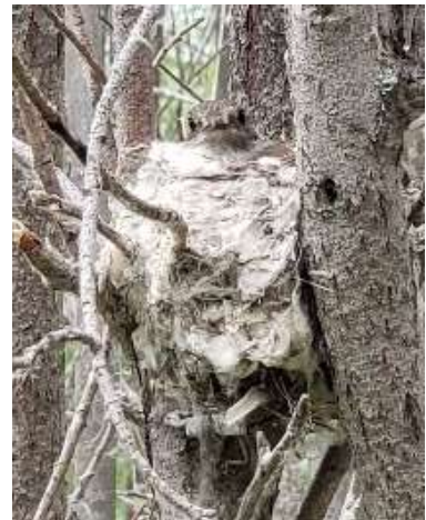
Least Flycatcher on her nest.

During the daily spring migration census, thousands of Franklin's Gulls were seen over Beaverhill Lake each day. The staff attempted to find a breeding colony on the lake, but the high water levels in the lake prevented them from the discovery. However, the staff were delighted with the water levels continuing to return to the lake.