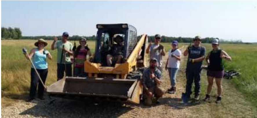
Volunteers and staff working to gravel the road access to the Natural Area that crosses the cattle pasture.