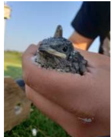
Purple Martin chick being banded.