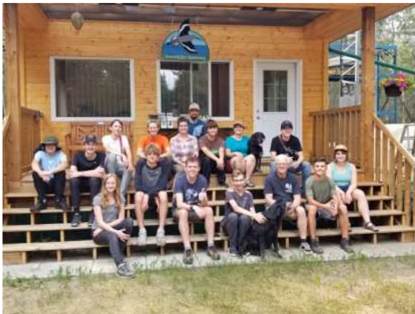
Group photo from the Young Ornithologists Workshop.