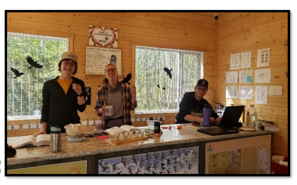
Summer Staff banding away!