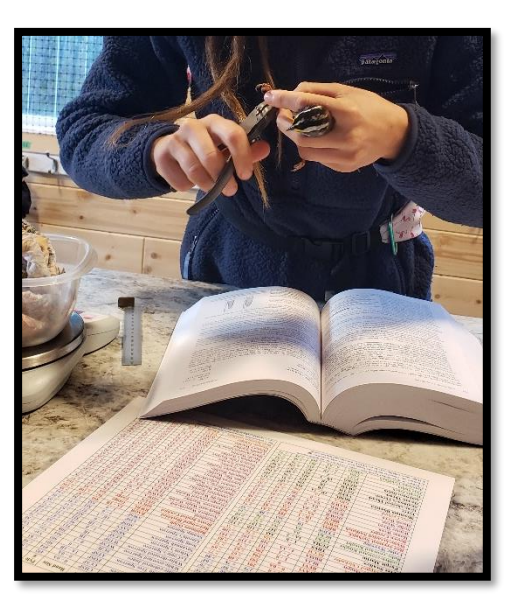
Staff banding a White-throated Sparrow

The standard 13 mist nets (2, 2X, 8, 9, 9X, 50, 51, 52, 53, 54, 55, 56, 57) were operated from May 1 to June 9 on mornings where temperatures were above 0°C, wind was below 20 km/h, and there was no precipitation. A total of 412 birds were caught in the standard net lanes, of which 246 were newly banded and 150 were repeats and returns (Table 1). A total of 37 species were captured, a modest improvement yet again to the previous years' totals! While the capture rate continues to hold promising recovery from lows prior to the global pandemic, the overall capture rate remained low compared to previous years.