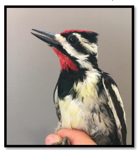
Staff had fun experimenting with a static grey board for standardizing photos of molt limits and clines within feather tracts of known aged birds!

From May 18 until June 9 staff hosted visitors on site for migration banding events. This year BBO hosted the well anticipated continuation of the Big Birding Breakfast on May 27 and 28. Eight student interns began working on numerous long-term monitoring programs in the natural area that will continue into the summer months alongside the standard banding efforts. They focus on Tree Swallows, House Wrens, breeding bird census, butterflies and bats.