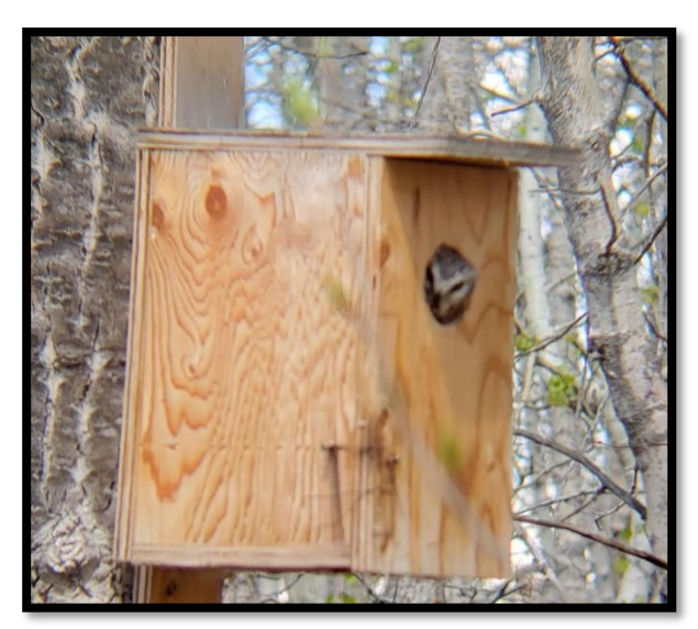
Momma Northern Saw Whet Owl in one of our Nest Boxes

Alongside the 13 standard mist nets, staff operated 7 experimental mist nets (58, 59, 60, 61, 62, 63, 64). These nets are located 25-50 m north of standard nets in grassland/ edge willow habitat that has been maturing over the last decade. A total of 665 birds were caught in the new nets, of which 512 were newly banded. 39 species were captured in the new nets as well for a combined 47 species between all 20 nets. As anticipated the capture rate was much higher in these nets at 83.75 birds per 100 net-hours – over 4 times greater than the capture rate in the standard nets.