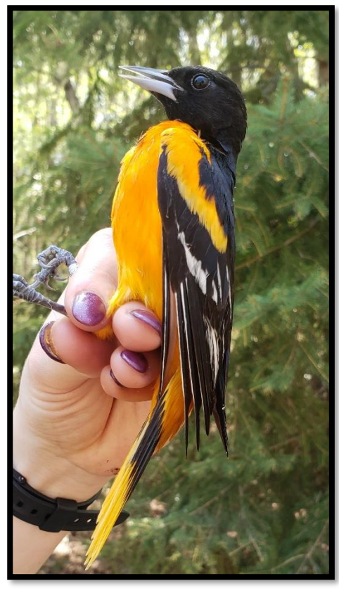
One of our many bold Baltimore Orioles around BBO this spring!

This spring was fairly on-par with expected visitors and migrants. Some interesting captures during migration monitoring included numerous Tree Swallows, as well as choice appearances by a Canada Warbler, a Magnolia Warbler, a Veery and a couple Western Wood-