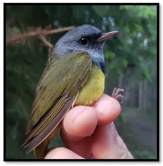
Stunning Mourning Warbler

pewee. While not an uncommon species in the natural area, the high number of House Wrens this year allowed some fun practice in different aging features with 27 House Wrens banded over the course of the spring!