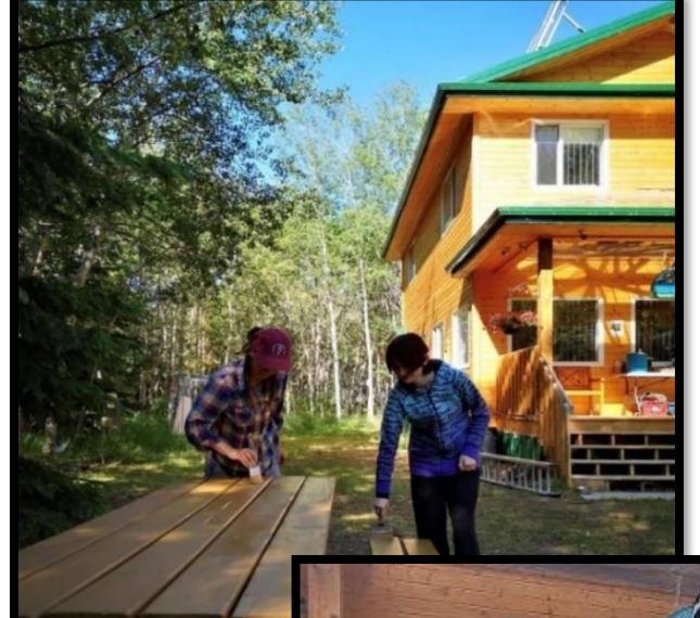
Successful June Work Bee in the summer sun