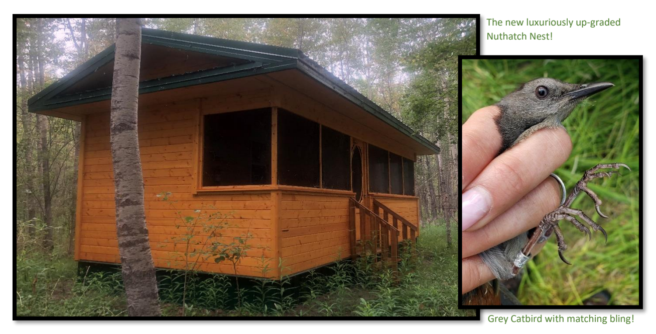
Table 1. Number of captures, net hours, species banded, and capture rates during spring migration at the Beaverhill Bird Observatory since 2007.