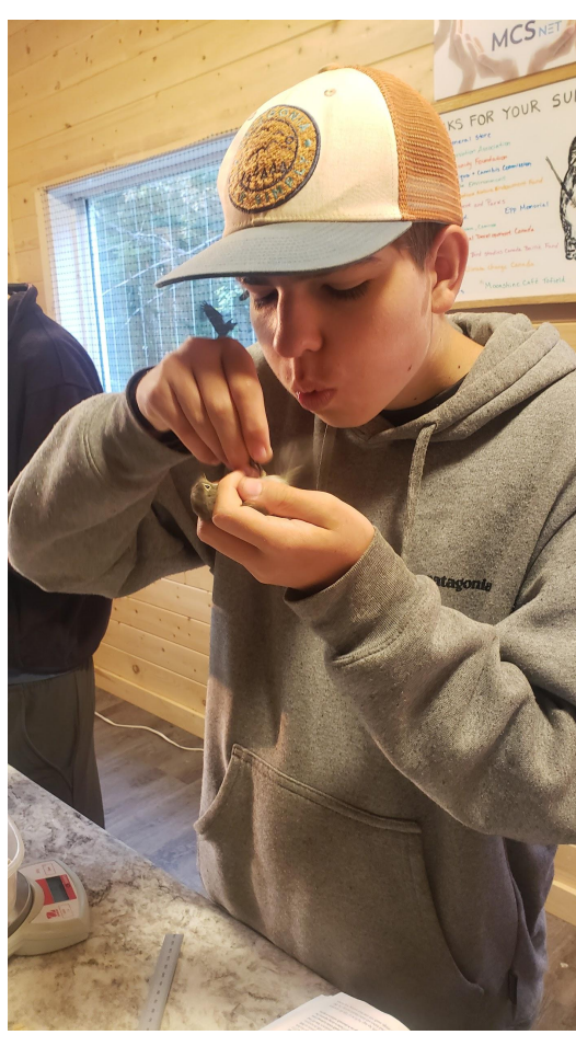
Examining a Least Flycatcher!