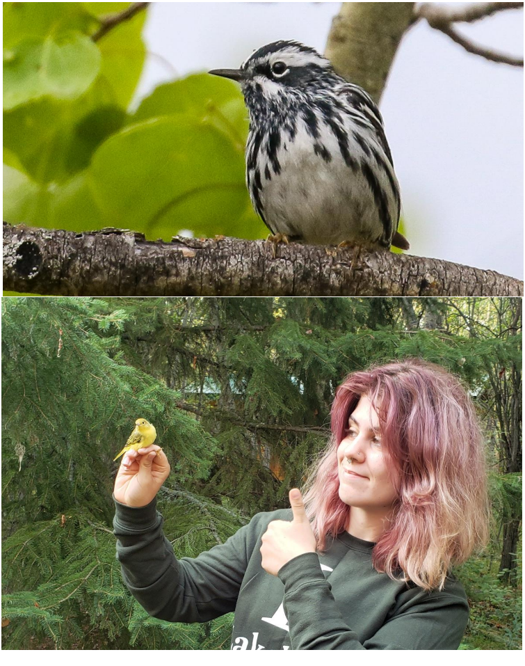
Successfully banded Yellow Warbler