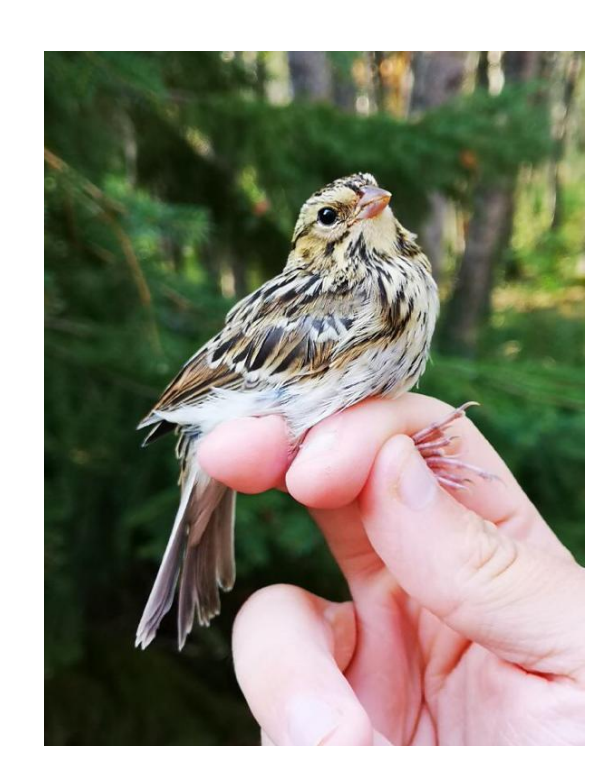
The first banded Baird's Sparrow in BBO history!

The Young Ornithologists were lucky to have several expert guest presenters speak over the course of the week, covering everything from Tree Swallows, to Butterflies, to the history of Peregrine Falcons in Alberta. Following up on the latter, the group got to visit our local Falconry, to see some of the raptors currently housed there, and do a duckling release thanks to WildNorth. They were also treated to a birding 'big day' led by local birding legend Irene Crosland. Totalling 98 species, the big day covered the BBO, Elk Island National Park, and a number of other local hotspots.