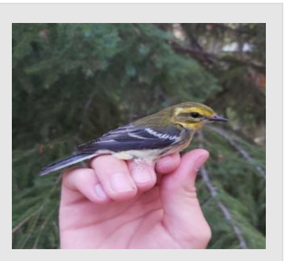
Black-throated Green Warbler