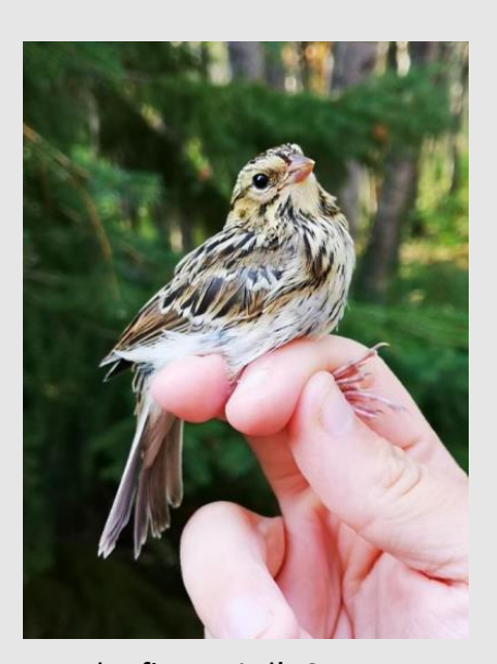
The first Baird's Sparrow ever caught at BBO

The Fall Migration Monitoring nets operated from July 20 to October 20, 2023, with 7 experimental nets and 13 standard nets for a total of 20 nets operated this season. An impressive 69 species and over 3000 individuals were captured, and the standard nets catching 58 species and 951 individuals and the experimental nets catching 54 species and 2121 individuals. As in previous years, the experimental nets outperformed the standard nets with 143.26 captures/100 net hours and 16 captures/100 net hours, respectively. However, this year, the experimental nets saw slightly less species diversity, with 54 species compared to 58 species captured in the standard nets.