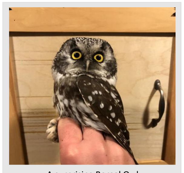
A surprising Boreal Owl