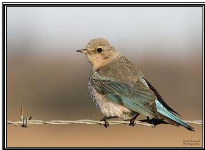
Paul Sumrell Spring 2006