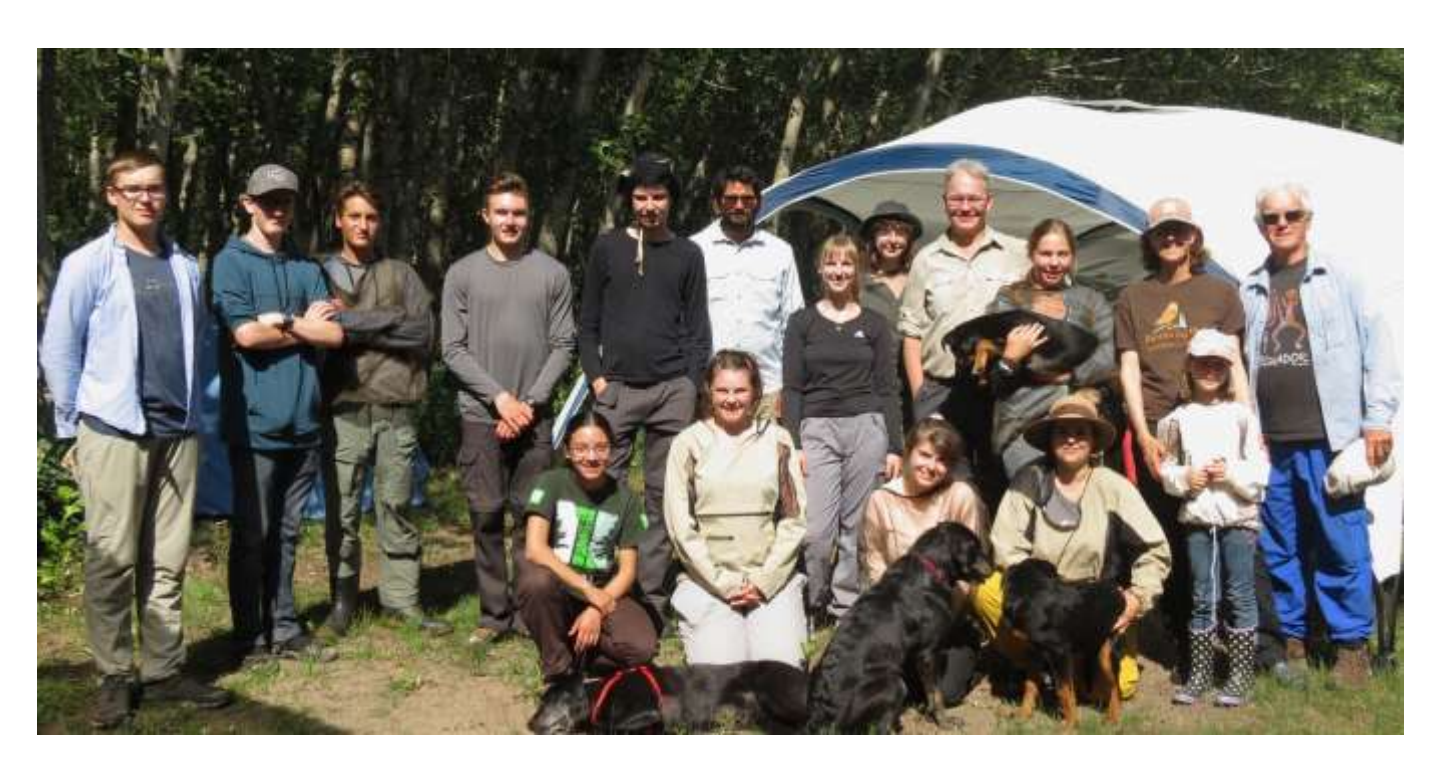
big sleep when they departed!

This 4th year of the Workshop brought participants from BC, AB, ON and QC together. Their enthusiasm for birding and an intrusion of dogs (two pups dumped on BBOs doorstep) made for an interesting week. The group saw 113 species on their Big Birding Day which included staying up most of the night for nocturnal species- all were all ready for a