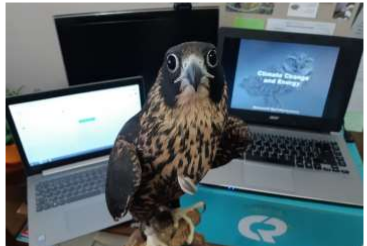
Figure 3. Maple teaching students about Climate Change and Energy