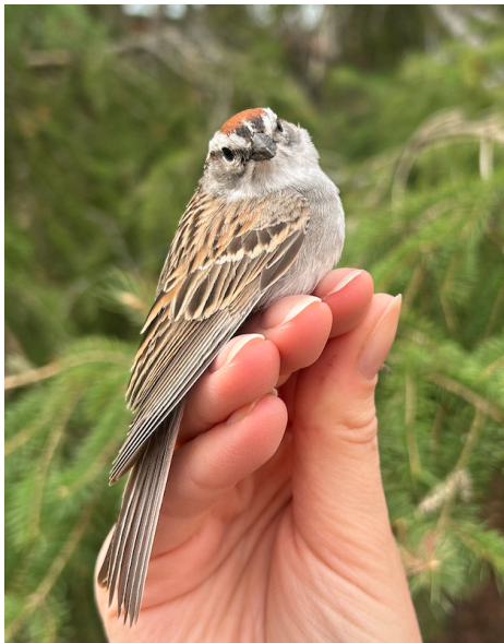
Stunning Chipping Sparrows have been filling our nets this week!